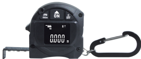
display on the backside